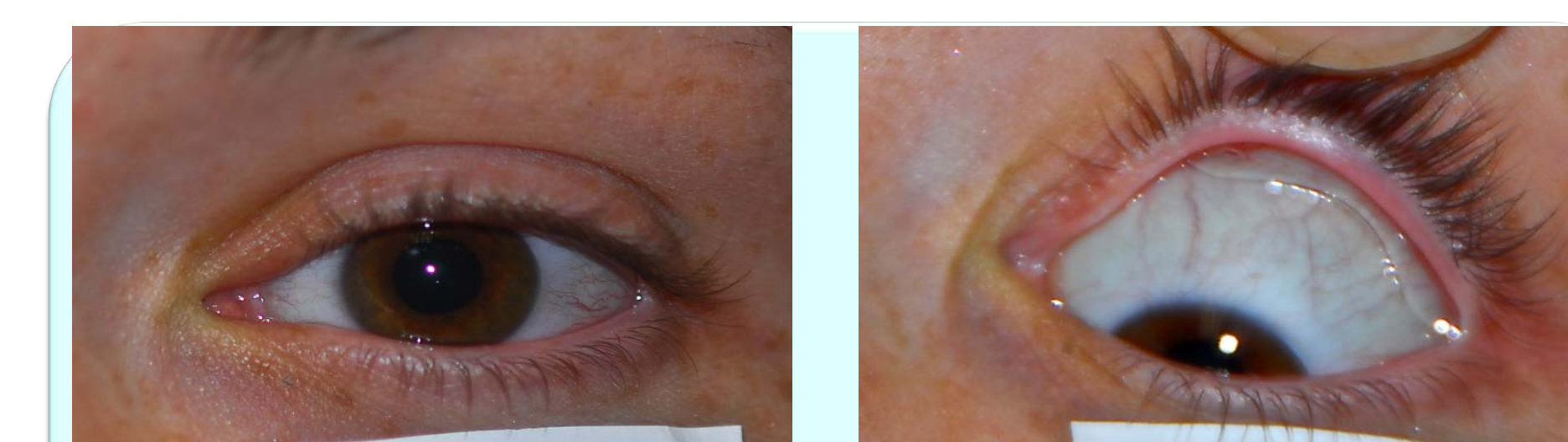
Subject with TODDD™ in place